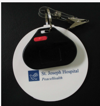
Patient badges at St. Joseph's are easily identified by these 'disks' which explain the badge's function and include a return address, if found.